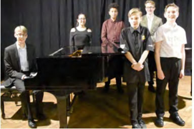
RECENT WINNERS AND RUNNERS-UP

Chester Music Society's annual prize competition for young musicians. For a prospectus and application form telephone 01244 678589 or email Info@chestermusicsociety.org.uk.